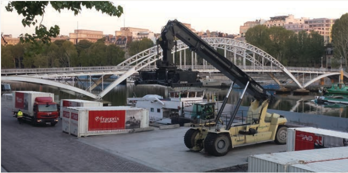
The Bourdonnais Port at the foot of the Eiffel Tower in Paris, France.